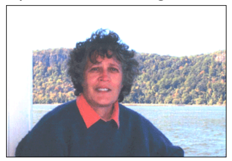
International Reading Association Annual Convention San Francisco, CA 2002 Tuesday, April 30 (9:00 - 11:45 am session)