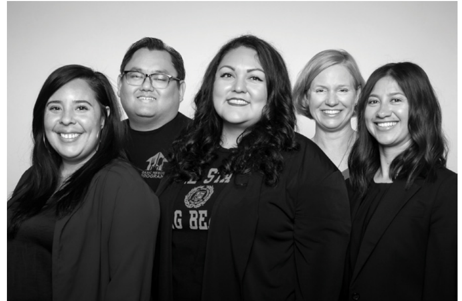
Basic Needs Team STUDENT AFFAIRS